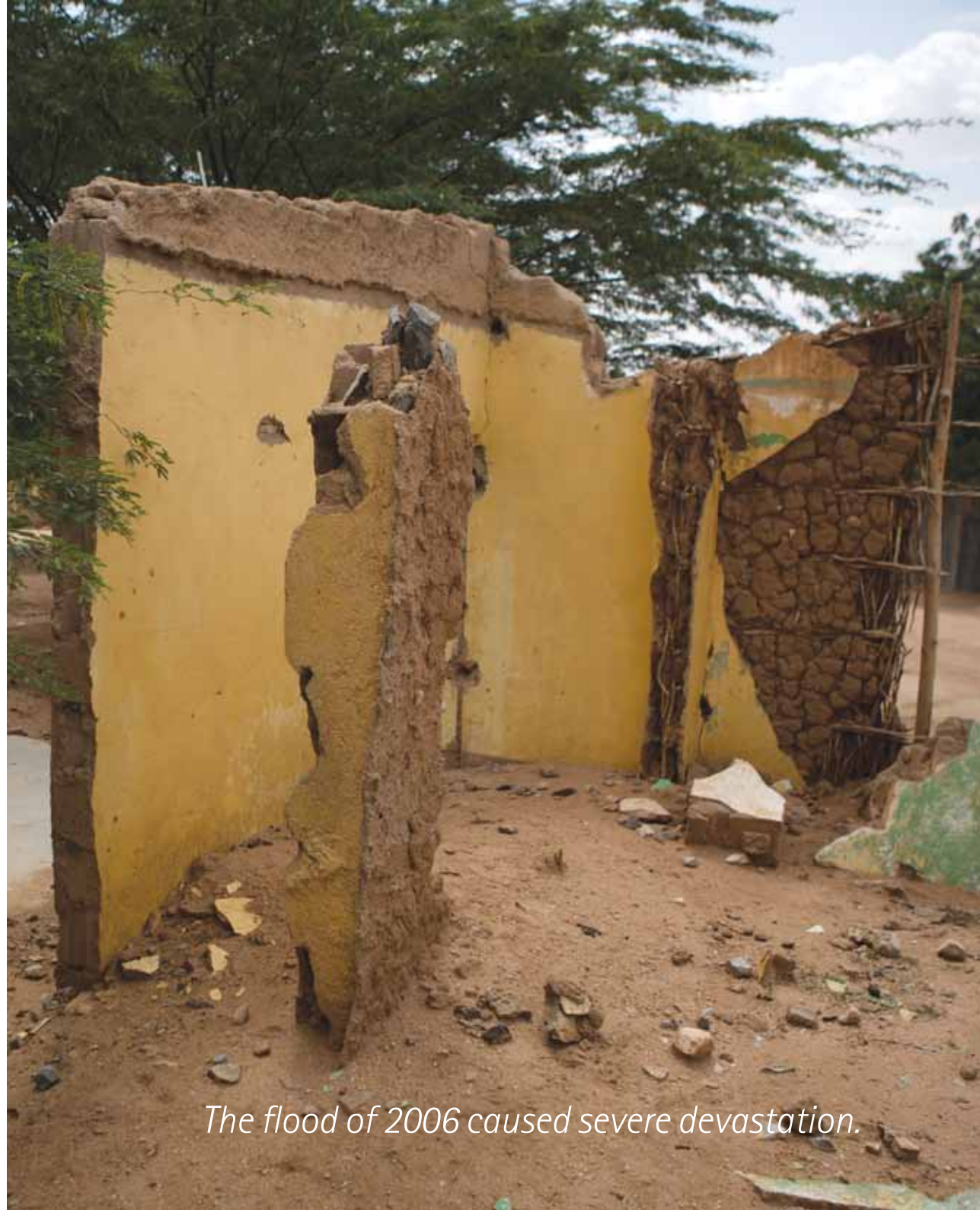
The flood of 2006 caused severe devastation.

Just as the community was beginning to come together, disaster struck in 2006, when a terrible flood ripped through the community killing hundreds of people and dislocating many more. Despite this setback, the deep poverty, other natural disasters and the scepticism of others, much has been achieved.